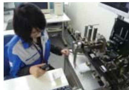
An original measuring instrument that simultaneously checks the position of tag printing and cutting

Under the slogan "Assuring quality for the mix of printers and supplies," Quality Assurance (QA) Department is committed to the development of new label materials and new printers with ever-improving quality.