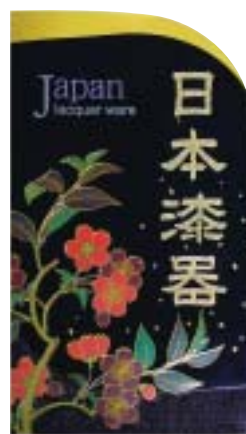
17th Japan Seal and Label Contest JFLP Chairman's prize

These contests assess not only the technical quality of the printing but also the artistic merit of the designs.