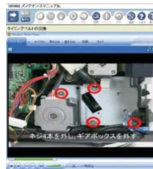
Technical training through PC videos